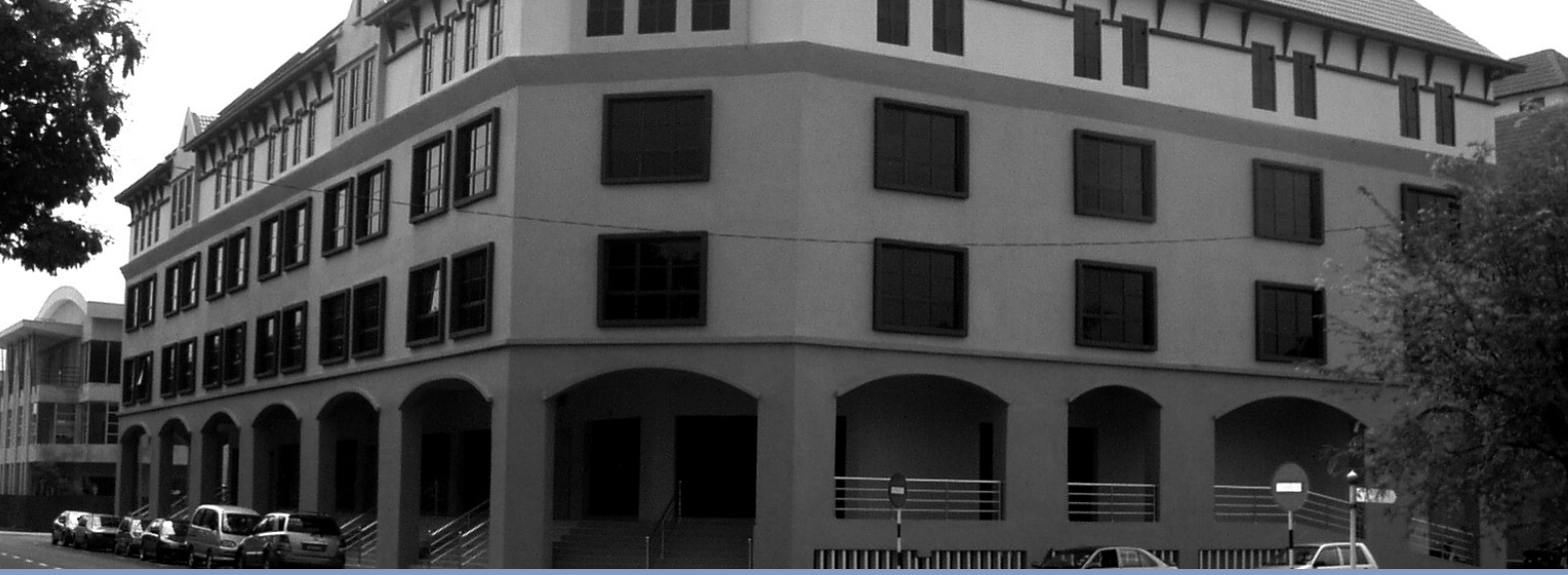
Office complex project in Greentown, Ipoh Projek kompleks pejabat di Greentown, Ipoh

The Group is constantly looking for feasible joint ventures as well as value acquisitions to replenish its existing landbank.