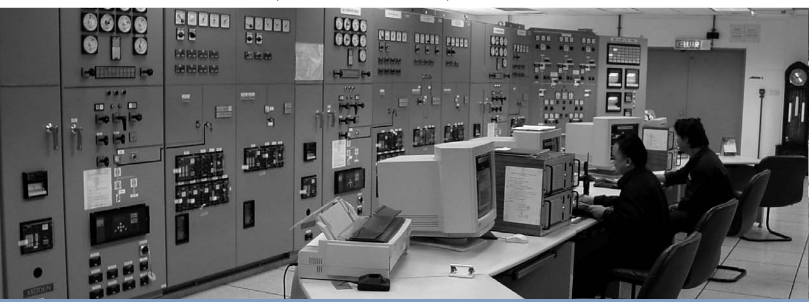
Power plant control room in Tawau Bilik Kawalan loji tenaga di Tawau

The Power Division registered a pre-tax profit of RM47.5 million (30.6.05 : RM59.1 million) and a revenue of RM171.0 million (30.6.05 : RM284.4 million).